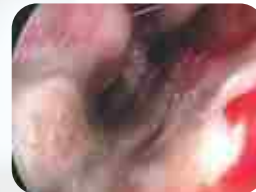
MUCOPURULENT DISCHARGE IN N.ASPERGILLOSIS