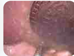
GASTRIC FOREIGN BODY ( COIN)