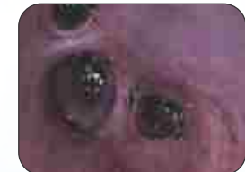
SEGMENTAL BRONCHIOLES WITH MUCOUS