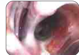
NASAL SEPTUM DISTORSION IN N. ASPERGILLOSIS