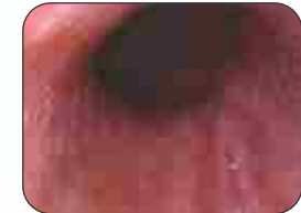
DUODENTAL PAPPILAE AND PEYERS PATCHES