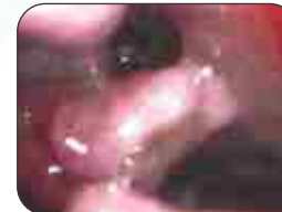
TURBINATE DESTRUCTION IN N.ASPERGILLOSIS