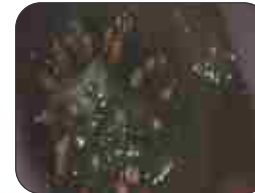
GASTRIC FOREIGN BODY( BALL)