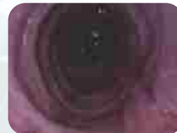
NORMAL TRACHEAL LIGAMENT